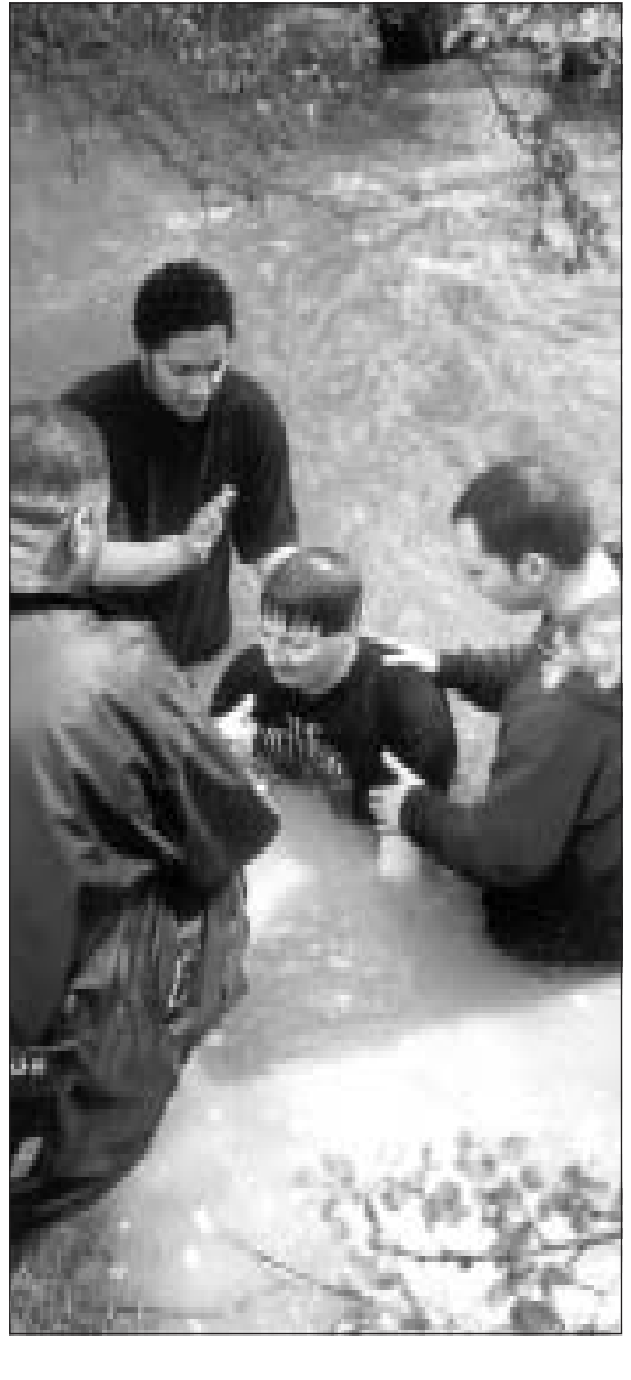
Your baptism confirms your transfer from one family to another!

1."We baptise you into the death, burial and resurrection of Jesus Christ."<sup>14</sup>