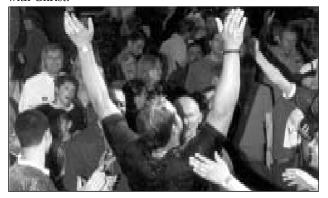
"My baptism was good. I'm dead, buried and alive with Christ."

So if you are dissatisfied with your baptism, you should check it through before God, and, if you feel it necessary, talk to leaders about it. You must believe in your baptism. If you can't believe in it then something's wrong. Believe in it and say "Yeah! My baptism was good. I'm dead, buried and alive with Christ."