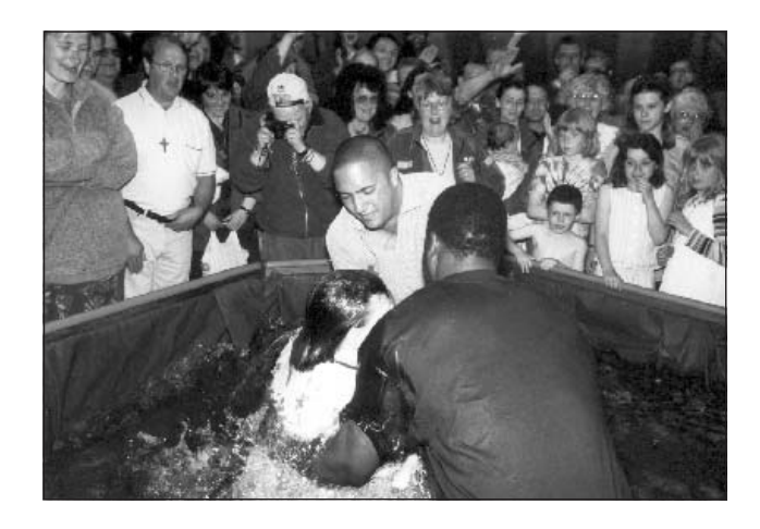
We baptise people in water when they are clearly born again.

The full baptism causes us to be baptised into Christ Jesus<sup>16</sup> (entering the "Christing", the anointing), baptised into the Trinity<sup>17</sup> (entering the family of God), baptised into the Body of Christ, His church<sup>18</sup> (entering the peoplehood, the "knitted together" body). All this is made effective by our baptism with and in the Holy Spirit (see Appendix 4 ).